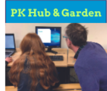
PK Hub & Garden

Therapeutic Gardening 1:1 & Group Sessions. Volunteers Needed